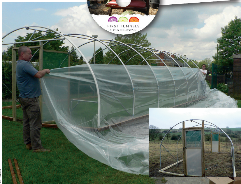
(above) It's easy to give a run-down Poly tunnel a new lease of life (inset, left) First Tunnels' website features a tube design service