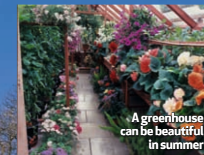
A greenhouse can be beautiful in summer