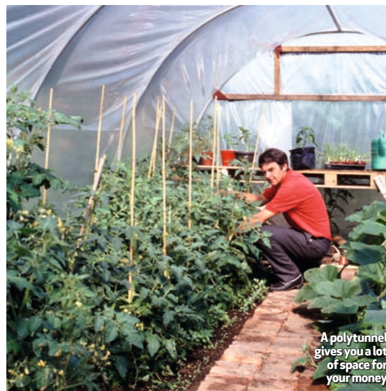
A polytunnel gives you a lot of space for your money