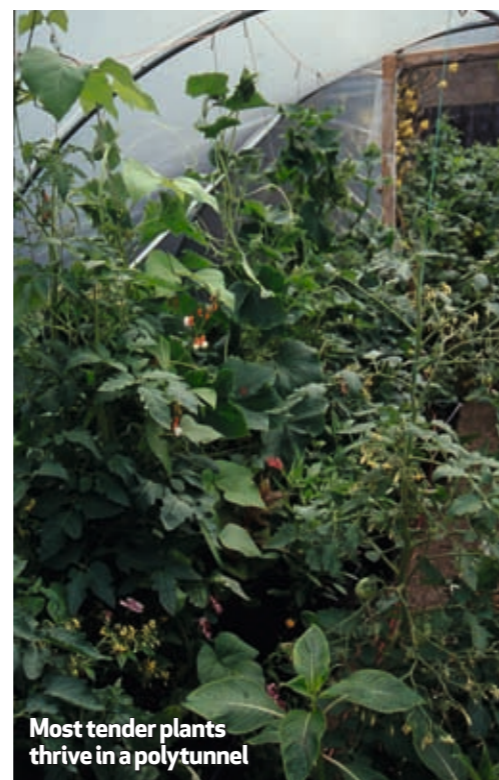
Most tender plants thrive in a polytunnel

Turn over for my decision chart in the polytunnel vs greenhouse debate. Thanks to First Tunnels and The Incredibly Sensible Greenhouse Company for all their help and advice.