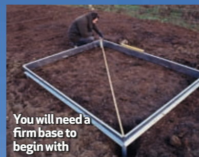
You will need a firm base to begin with