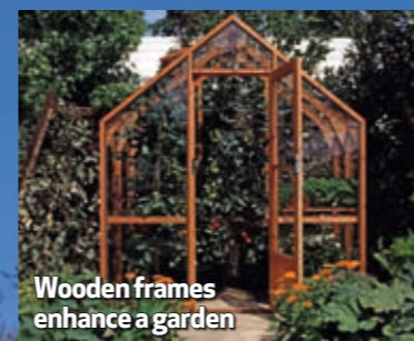
Wooden frames enhance a garden