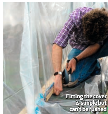
Fitting the cover is simple but can't be rushed