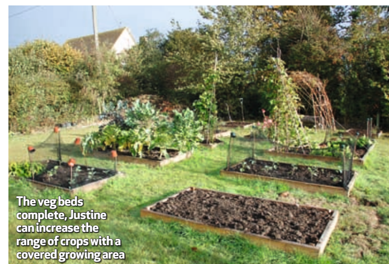
The veg beds complete, Justine can increase the range of crops with a covered growing area