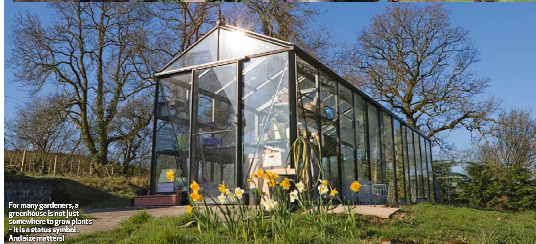
For many gardeners, a greenhouse is not just somewhere to grow plants – it is a status symbol. And size matters!