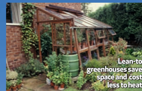
Lean-to greenhouses save space and cost less to heat